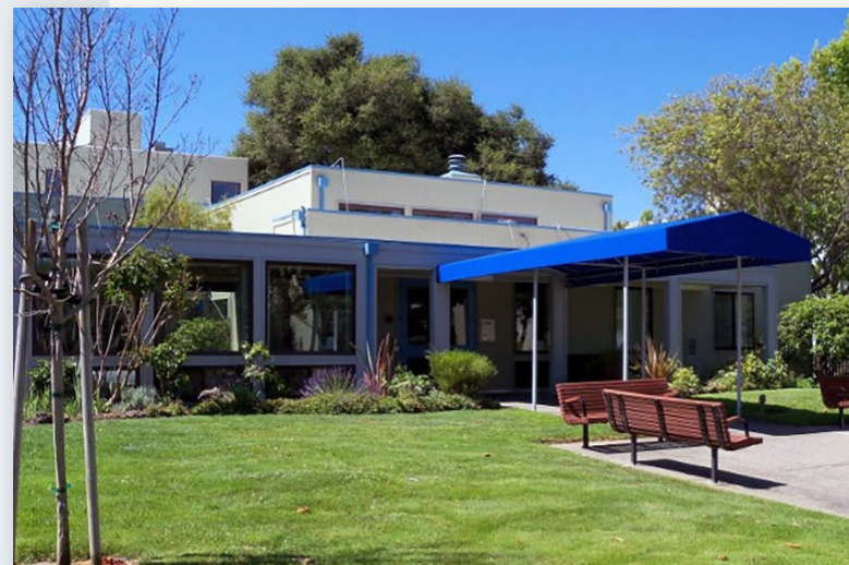
St. Mary's Garden's: Apartment complex with 101 one-bedroom units built in 1979 in PG&E service territory

The property owner acknowledged the challenges faced when pursuing a solar PV system, including soliciting bids from contractors and reviewing the bid details. However, they emphasized that overcoming these hurdles was essential to maximize the economic relief provided to the residents. For guidance, the property owner turned to the SOMAH Technical Assistance (TA) and Support Services team for support soliciting bids from solar contractors and ultimately selecting a solar contractor.